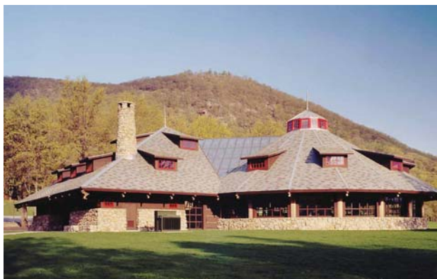
Bear Mountain Carousel, in Bear Mountain State Park, Bear Mountain, NY.